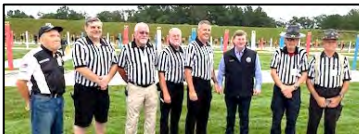
Twenty Twenty-Four NPSC Referee Team with Governor Reeves.