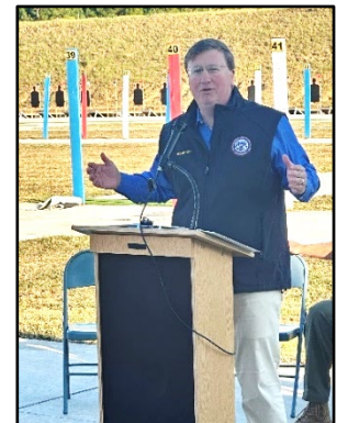
Mississippi Governor Tate Reeves welcoming competitors to Mississippi and the Championships.