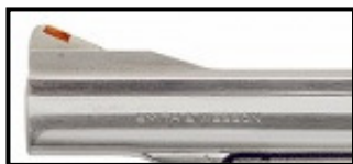
Smith & Wesson Insert Type Front Sight

Example 1: A shooter has a Smith & Wesson Model 66 and has the factory sight removed, the base ramp milled down slightly, a dovetail cut into the base, and a new front sight installed.