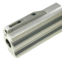
Sight Base Installed