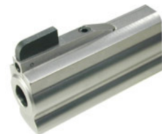
Front Sight Installed in Base